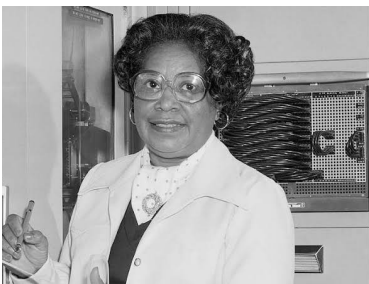
Pictured here: Dorothy Vaughan

Another example of a prominent black American is Frederick McKinley Jones who was an American inventor, entrepreneur, engineer, he won the National Medal of Technology, and an inductee of the National Inventors Hall of Fame. He invented mobile refrigeration technology. He received 61 patents, 40 for refrigeration technology. Next, Ida B. Wells was an American Investigative journalist, an educator, and a leader in the civil rights movement. She was one of the founders of the National Association for the Advancement of Colored People. Mae Carol Jamison is an American engineer, physician, and former NASA astronaut. She became the first black woman to travel into space when she served as a mission specialist aboard the space shuttle Endeavor in 1992, she is still alive today.