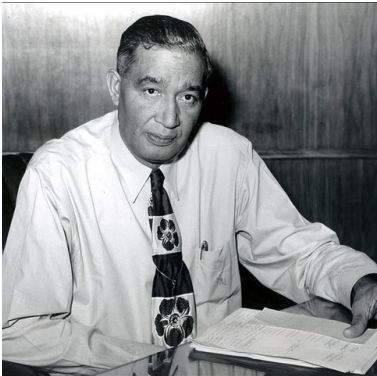
Pictured here: Frederick McKinley Jones

Historically speaking, Black History Month was originally not even a month; it used to only be a week long and was changed when the U.S. president Gerald Ford decided to extend it to honor the achievements of Black Americans throughout history. There are many well known famous Black people like Rosa Parks, Martin Luther King Jr., George Washington Carver, Barack Obama, and many more. However, there are many more important black voices that are not as well known. For example, Gwendolyn Brooks. Gwendolyn Brooks was an American poet, she was also an author, and a teacher. She wrote about personal struggles and celebrations of ordinary people in her life and community. She won the Pulitzer Prize for Poetry on May 1, 1950, for Annie Allen , making her the first African American to win a Pulitzer Prize.